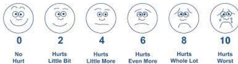
Wong-Baker FACES® Pain Rating Scale