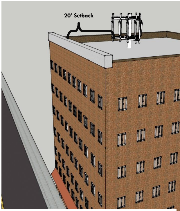
Figure 15.14.130-3 Rooftop towers and antennas shall be camouflaging shall be set back a minimum of if located within 20' from of the roof's edge.

Section 13. That LMC Figure 15.14.130-3 be is amended to read as follows: