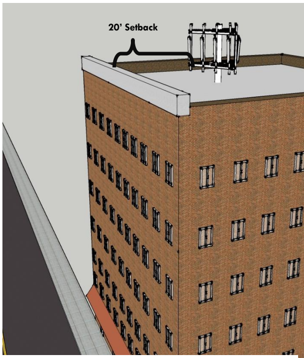
Figure 15.14.130-3 Rooftop towers and antennas shall be camouflaging shall be set back a minimum of if located within 20' from of the roof's edge.

Section 13. That LMC Figure 15.14.130-3 be is amended to read as follows: