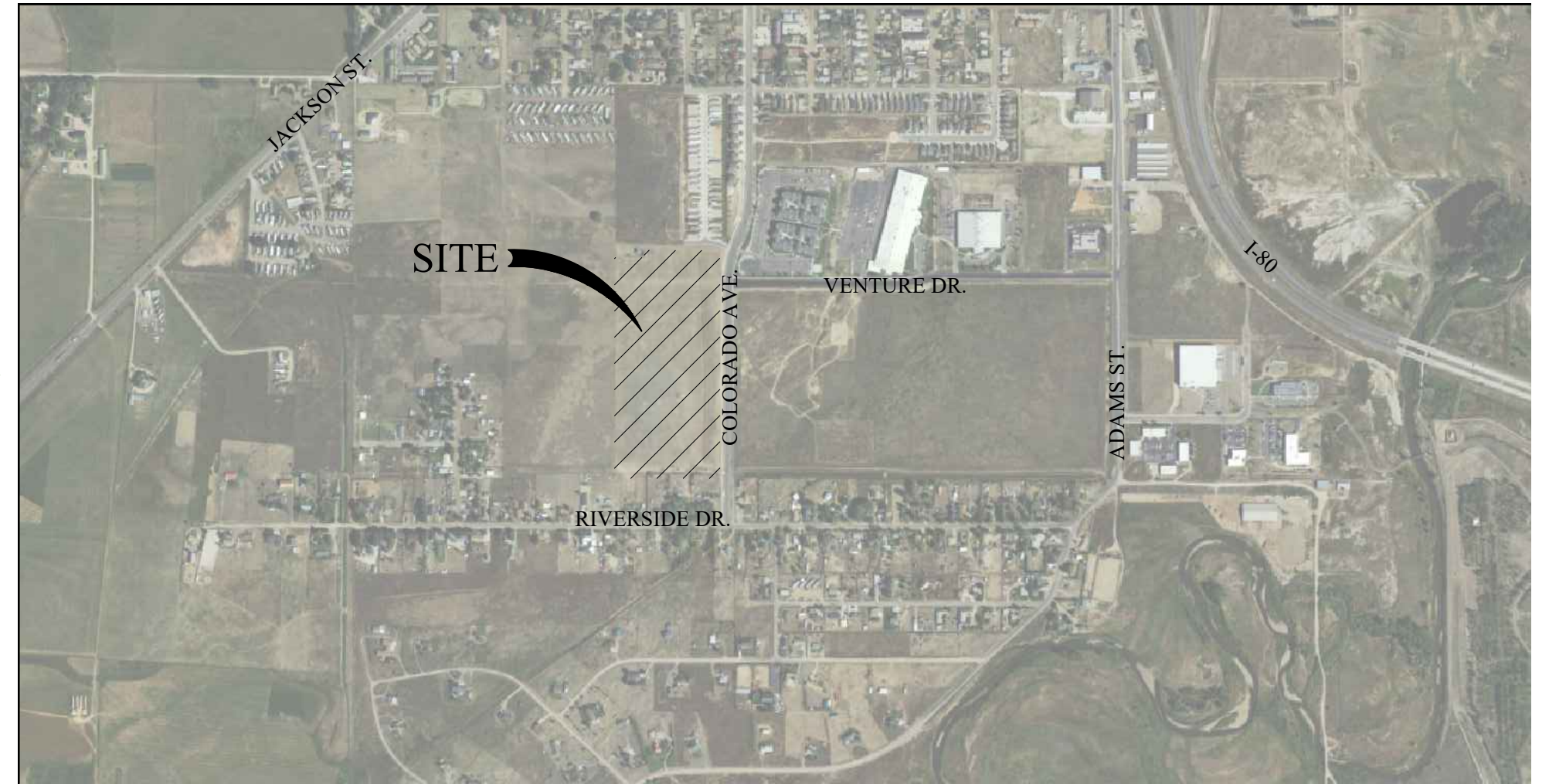
VICINITY MAP SCALE: 1"=1000'