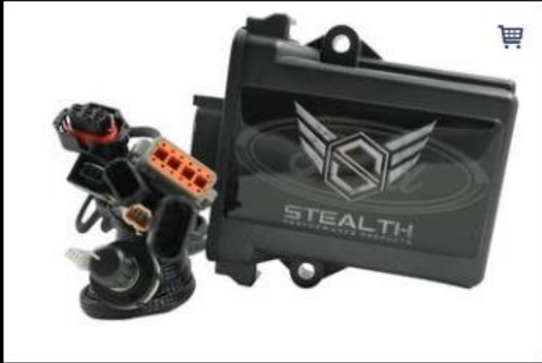
Stealth Module - Ford Powerstroke 6.7L (2011-2019)