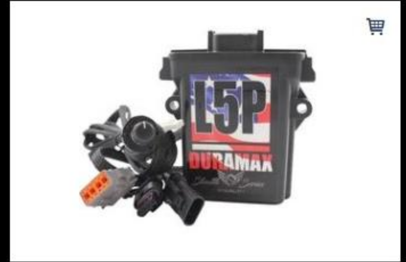
Stealth Module - Chevy/GMC Duramax L5P 6.6L (2017-2018)