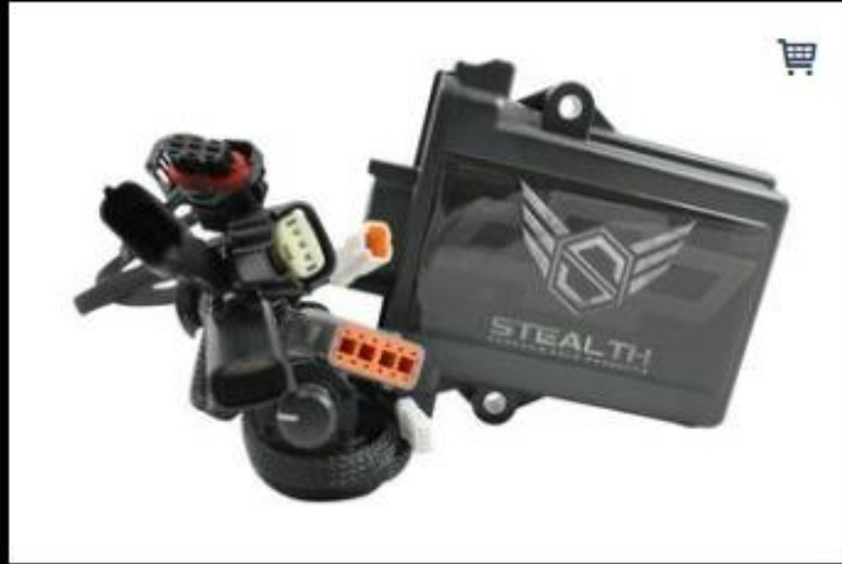
Stealth Module - Chevy/GMC Duramax LML 6.6L (2011-2016)