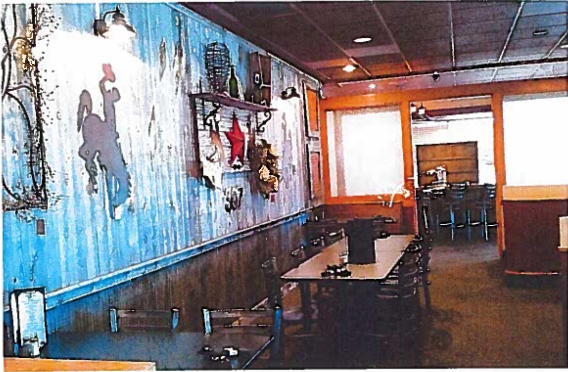
DINING AREA (PRESENT)