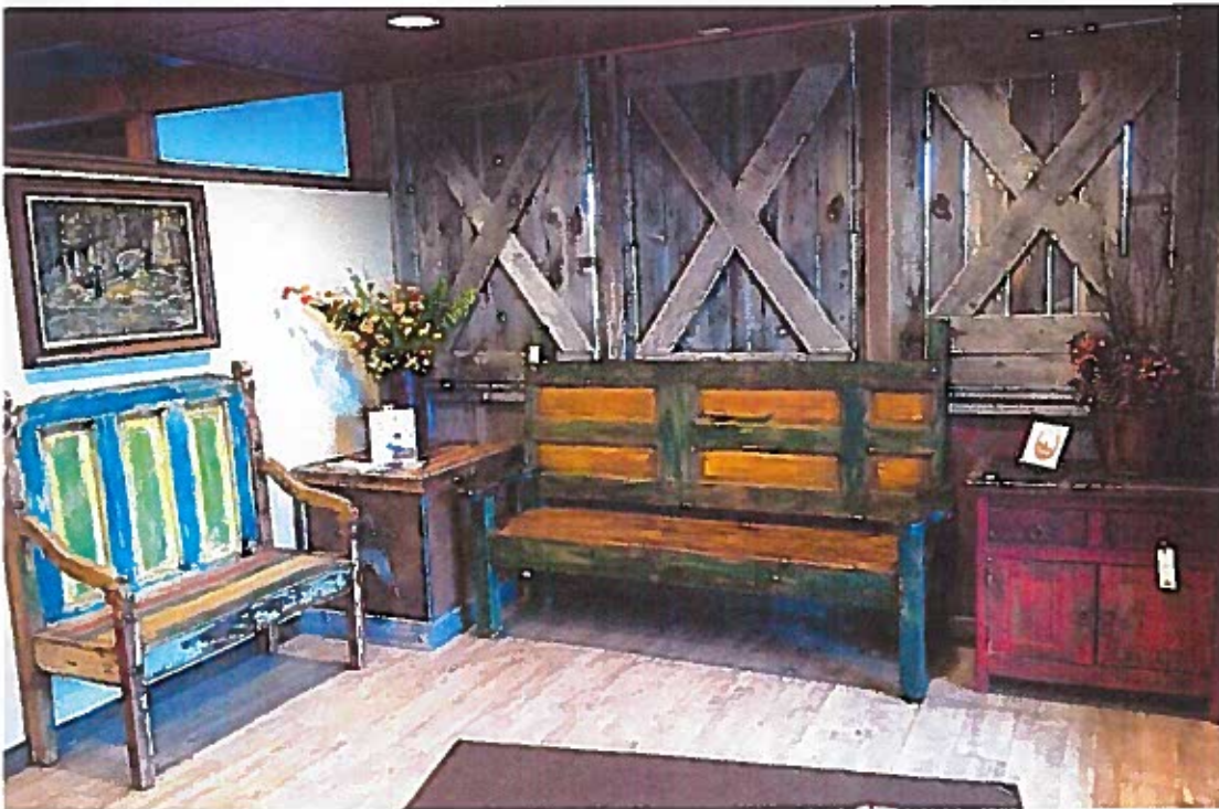
Waiting area (present)