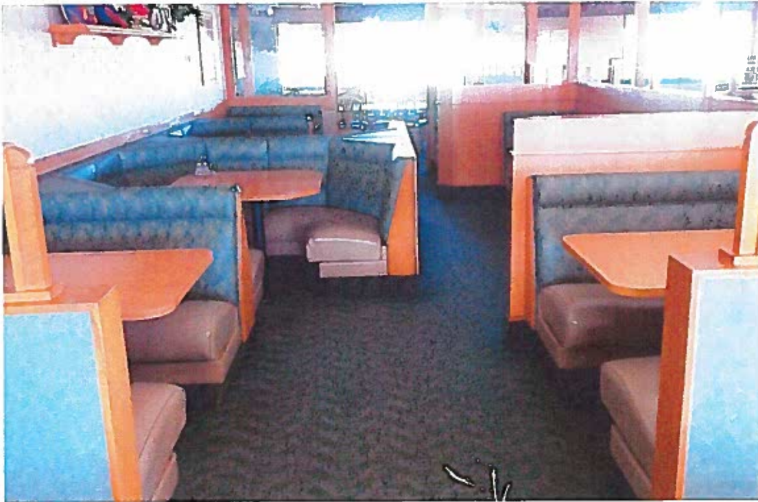
DINING AREA (BEFORE)